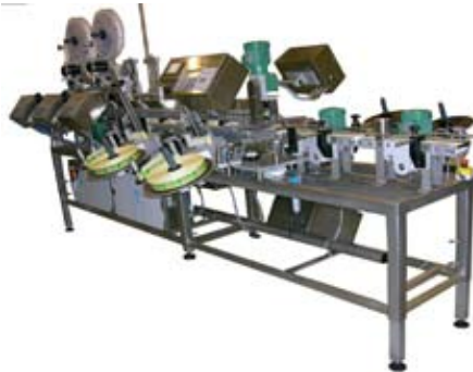
Automatic labelling of salad products