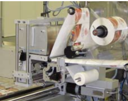
HM 3000 labeller for hi-speed operation