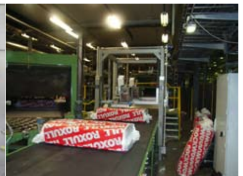
Print & Apply system for insulation products