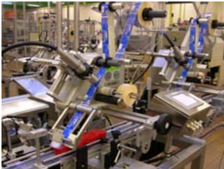
Labelling systems for dairy products

Whether it is advanced high-speed solution for the food industry, more simple systems, single label dispensers or printers, HM has a the right solution: