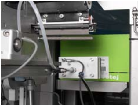
HM Linerfree Systems® for food production