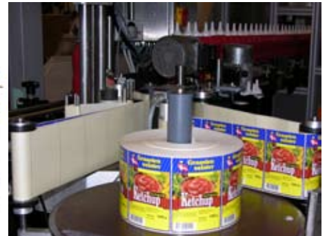
Side labelling application for plastic bottles