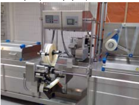
Cross web solution for fish products