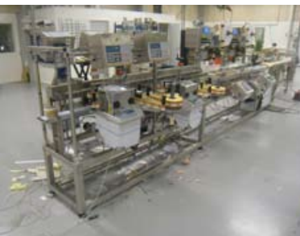
Complete automatic hi-speed labelling line for trays