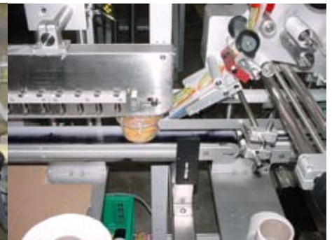
Application for salad production